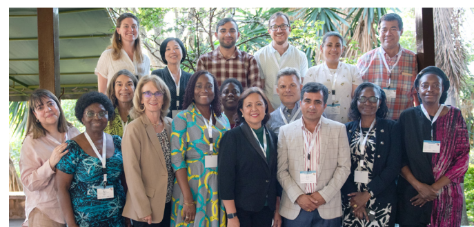
International Advisory Board members, Annual Meeting in Nairobi, Kenya, 2023