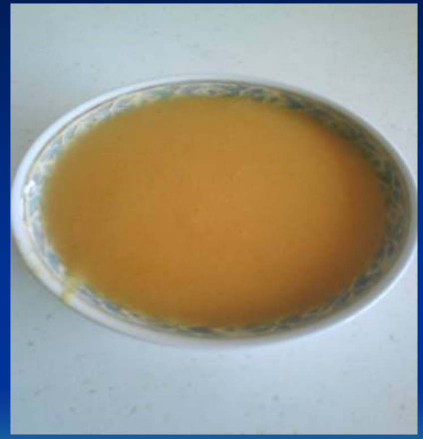
MAYVITA 25 MAYVITA 50